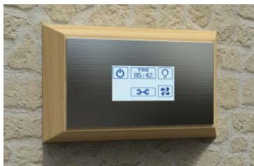
Stainless Steel Touch Control (for steam generators)