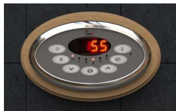
Classic Control (for steam generators)