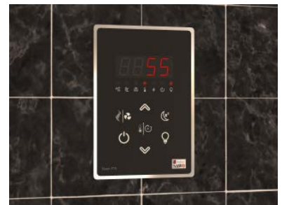
STP Classic 2.0 Control (for steam generators)